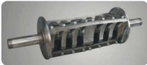
V type Cutter saddle